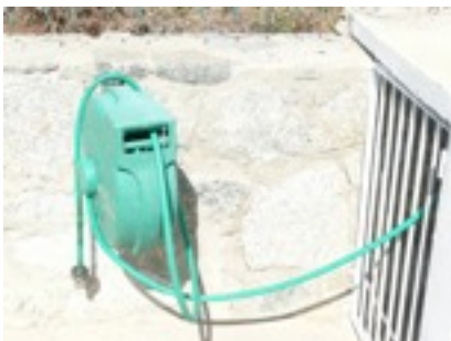
A spot for washing cars is in the center of the new lot.