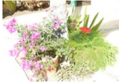
New flower pots are in place, it seems the roots of the palm trees smother plants, pots are a good choice.