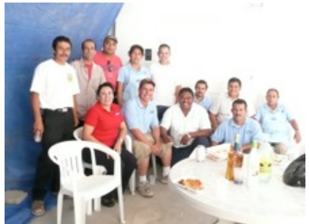
The staff enjoying their Christmas party.