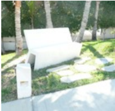
At our entrance is a new bench for those awaiting taxis.

The word for Mykonos this season is change.