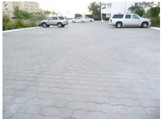
The parking lot by building C is finished with new pavers. No more dust! Spaces are available for different sized vehicles all striped and ready.