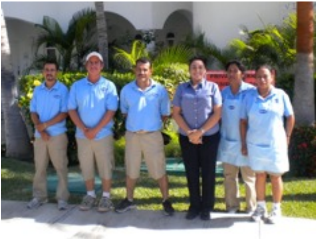
The staff in their new uniforms.

Our lawn is green and fertilized. Repairs are being done as needed. A garden crew arrives every tuesday, they supply lawn mowers and other garden utensils, a savings for us. We are looking upscale, folks, like our complex should.