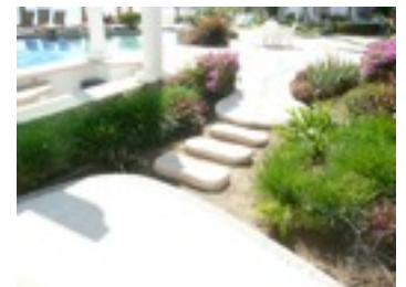
Repairs and new steps in the garden.