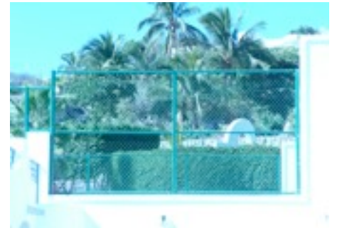
New fencing around the Tennis court

Gert has been collecting gym utilization statistics so the HOA can better serve you, the owners. When using the gym, please, SIGN IN using the CLIPBOARD. The HOA needs you to do this for each visit so they can better determine the gym users' needs based on equipment use. We are blessed with a beautiful gym with good workout equipment. Try to remember to wipe down the equipment after each use. Fans and lights take electricity, if, no one is in the gym when you leave PLEASE turn off the fans and the lights. It is your dollars you are wasting when you forget to conserve electricity.