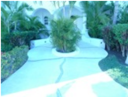
Each building has a new handicap ramp