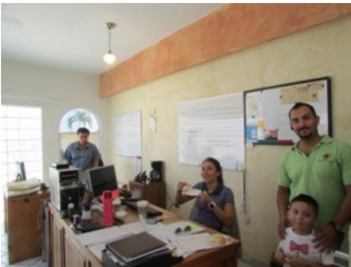
A SMALL CELEBRATION IN THE OFFICE FOR EL DIA DE LOS REYES