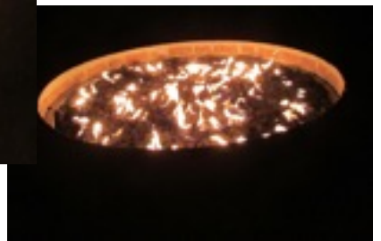
OUR NEW FIRE PIT AT NIGHT

HERE AT MYKONOS JANUARY INTO FEBRUARY HAS BEEN A BUSY TIME. FOR THOSE OF US STAYING HERE IT HAS BEEN FUN WATCHING THE DAILY CHANGES TO OUR NEW LANDSCAPE DESIGN. OVER THE WEEKS THERE HAS BEEN MUCH PROGRESS, AS SHOWN BY THE PICTURES BELOW.